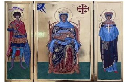
The new Tryptic of Our Lady Queen of Palestine in St George's Cathedral, Southwark

On the Feast Day of Our Lady Queen of Palestine, (25 th October), a special Mass was held at St George's Cathedral in Southwark, for peace in the Holy Land.